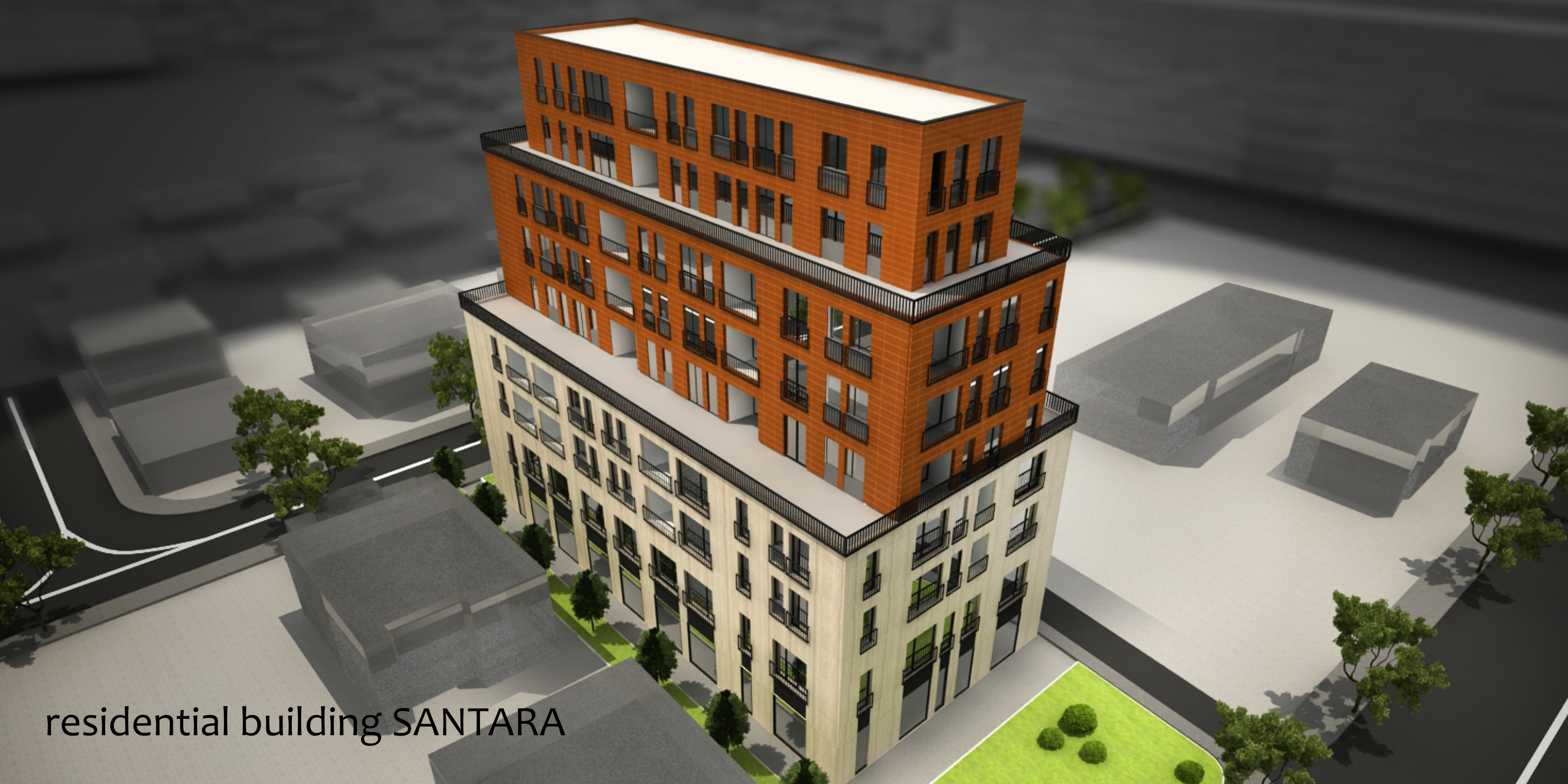
residential building SANTARA